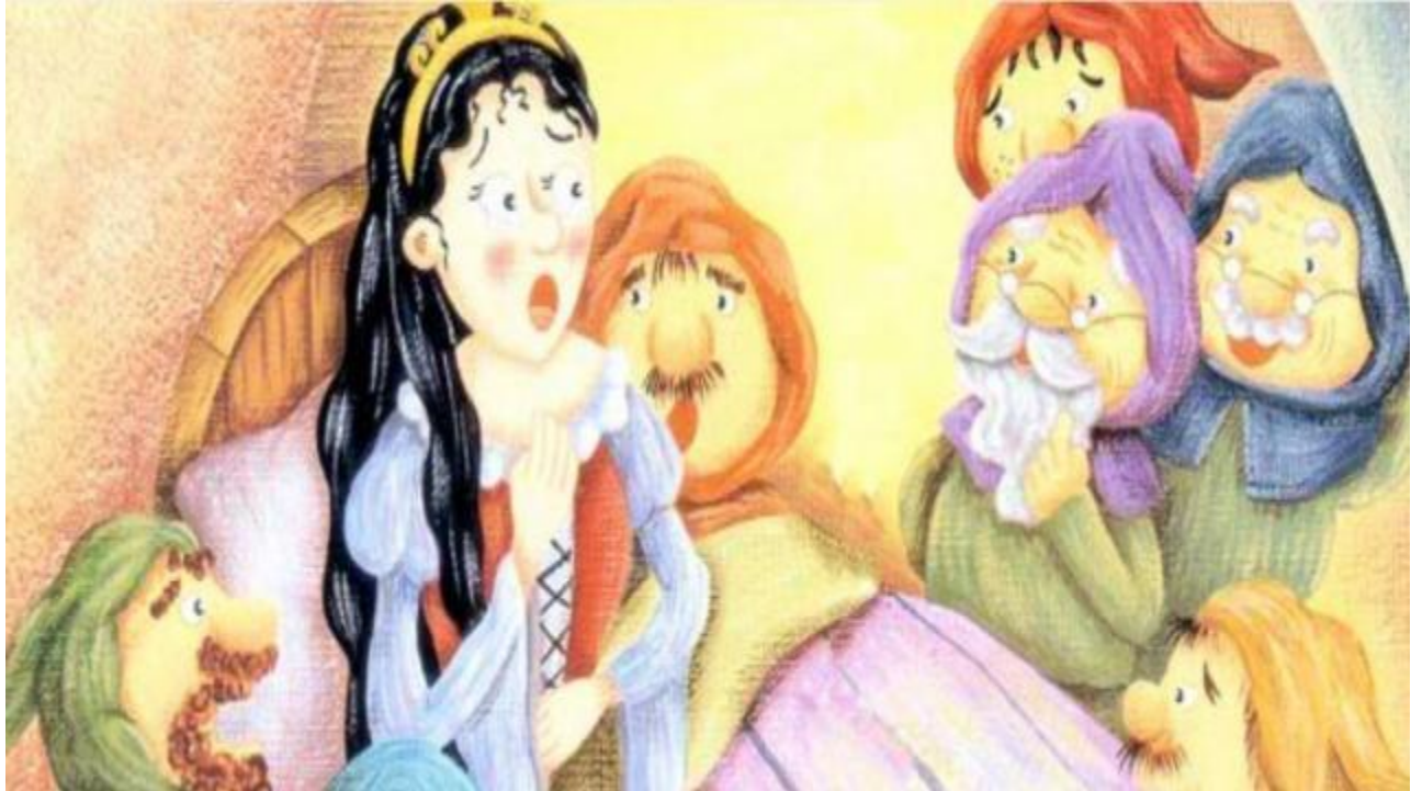
The dwarfs found Snow White. She was very surprised.